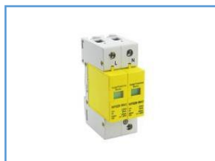
AC Surge Protector ALB-220-10KA/2 ALB-220-20KA/2