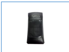
Datix Accessories WP-CVRB