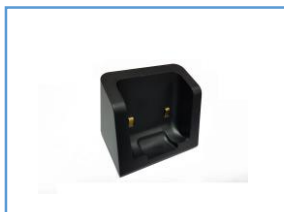
Datix Accessories WP-BC