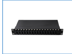
Rack Mounted Media Converter Chassis ALP-2URMC-14-AC