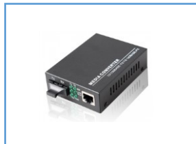
Media converter ALP-FCN-G-SC-05 ALP-FCN-G-SC-20 ALP-FCN-G-SFP