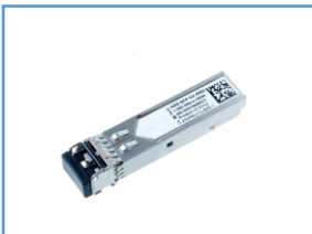
SFP see page 28