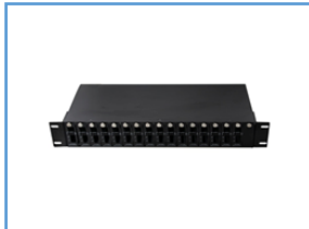
Rack Mounted Media Converter Chassis ALP-2URMC-14-AC