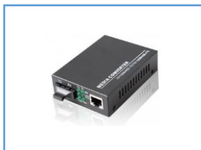
Media converter ALP-FCN-G-SC-05 ALP-FCN-G-SC-20 ALP-FCN-G-SFP