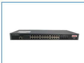
L2 Managed Gigabit Switch ALP-24100G-SW-L2