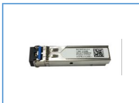
SFP ALP-SFP-G-05 ALP-SFP-G-2 ALP-SFP-G-10 ALP-SFP-G-30